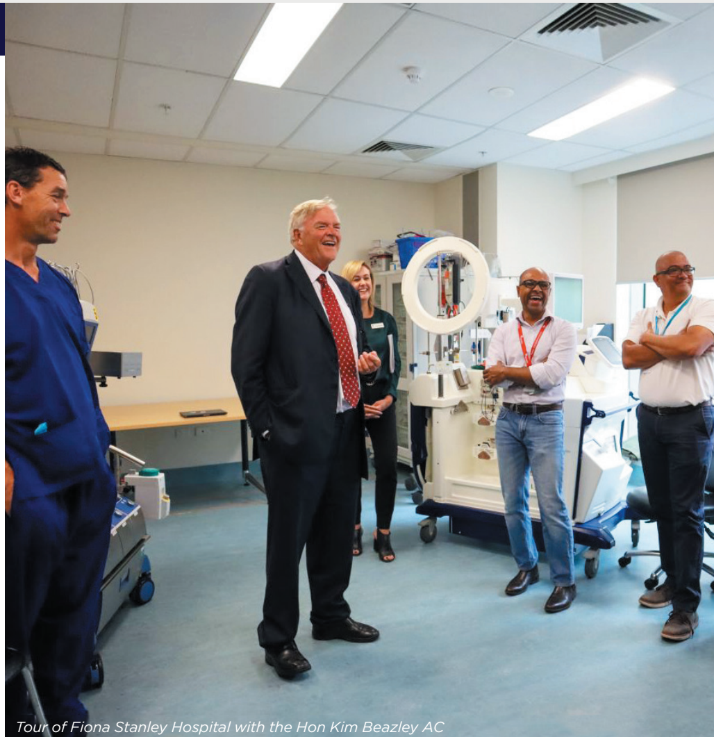
Tour of Fiona Stanley Hospital with the Hon Kim Beazley AC

There is certainly some exciting research happening throughout Fiona Stanley Hospital and Spinnaker is proud to be able to support it due to the continued generosity of our donors.